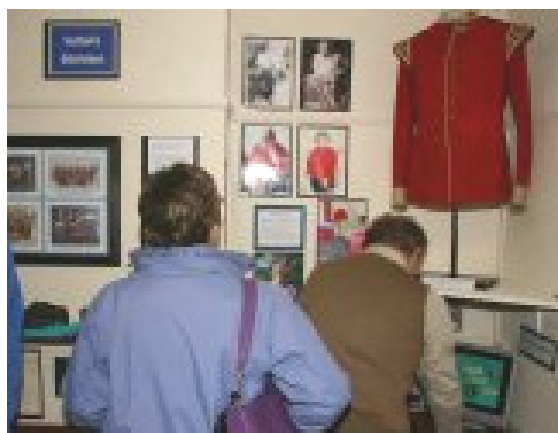
Walk and Talk Visitors examine the exhibits

Many diverse groups are seeking new ideas and activities for their regular get-togethers. So we thought we would try to address both their objectives and our own by providing an evening activity based on the Cardall Collection, lasting for about two hours. First there is a short conducted walk around the centre of the town that takes about an hour. It is led by a one of our volunteers who explains the background to some of the more interesting buildings in the town. At each stopping point the group is shown pictures of how that part of the town used to look in days gone by, as well as being told something about the history of a particular building or area.