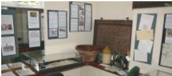
Part of our new display area

We tried various means of eliminating moving objects - curtains, vibration from thundering lorries, mice etc. Eventually, after our Chairman taking over 400 photos of the alarm console over a two month period to record all the messages being generated when the alarm was triggered, it was decided that the problem was a faulty circuit. This was put right by connecting one of the sensors to a spare circuit, and hopefully the problem will not recur.